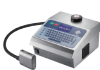
Large Character Inkjet Printer