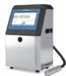
Continuous Inkjet Printer