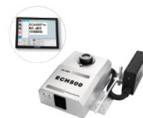
Piezo High Resolution Inkjet Printer