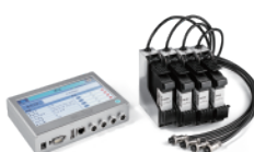
High Resolution Inkjet Printer